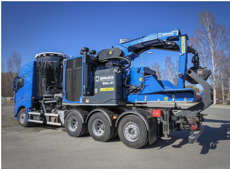
MOBILE CHIPPER 1006.3 RT