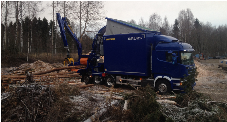
MOBILE CHIPPER 806.2 PTC TRUCK