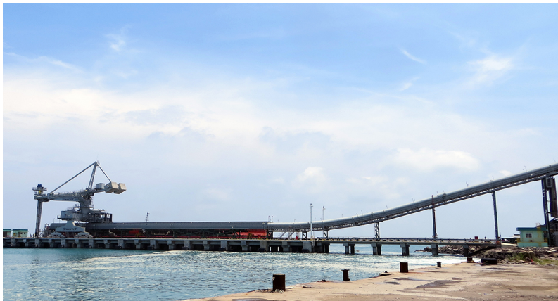
IDLER BELT CONVEYORS